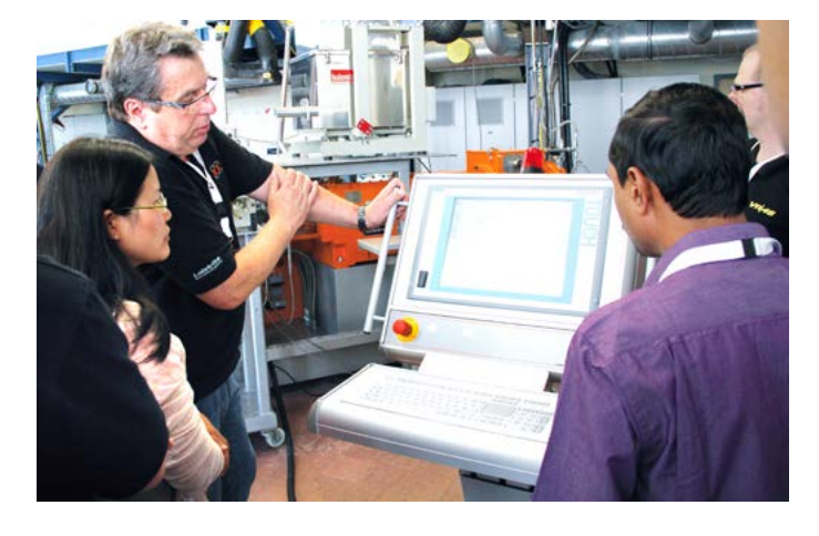
All topics are illustrated by practical lab demonstrations.

The training is conducted by experienced Leistritz employees and partners who have been dealing with operation, configuration and maintenance of extrusion lines for years. Thus a competent and practical training is guaranteed.