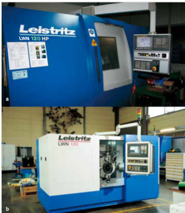
Picture 2: a The Whirling Machine LWN 120 HP that All Homg purchased; b. Whirling machine LWN 120 at Leistriz facilities

Only 40 % of the machine capability could be used at that time due to the economic situation. Now it's getting better and better. Therefore orders are also becoming more and more. "Of course, the demand is increasing because our customers know that we have Leistriz machines. On the other hand Leistriz provides very good service, too. As soon as we face with new problems during the processing we always get a proper help immediately." Mr. Hong indicated: "If there are too many orders for one Leistriz machine to process we will buy another one. The investment of such a machine is not cheap but highly efficient. Overall it seems very cost-effective."